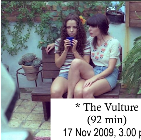
* The Vulture (92 min) 17 Nov 2009, 3.00 pm Subtitles: English