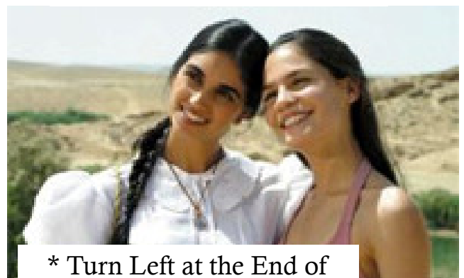
* Turn Left at the End of the World (108 min) 19 Nov 2009, 5.30 pm Subtitles: English

Free Passes are available at the Embassy of Israel, Lazimpat (Tel 4411811 / 4413419) or, on the day of the show, at the Russian Cultural Centre from 1 pm onwards. Entry to movies marked with (*) will be allowed to viewers above 16 years.