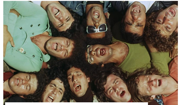
Kazablan (122 min) 18 Nov 2009, 5.30 pm Subtitles: English