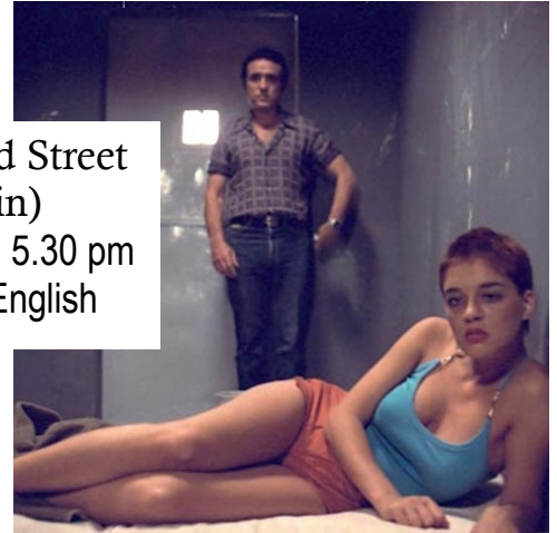
* Dead End Street (86 min) 17 Nov 2009, 5.30 pm Subtitles: English